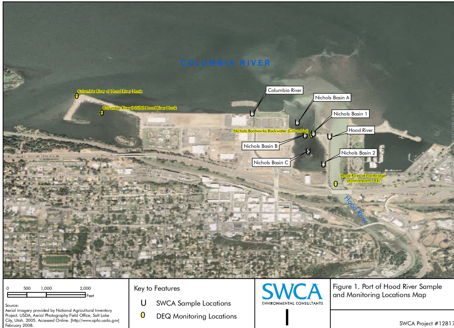
Figure 1. Aerial photograph of the project area with project sampling locations depicted